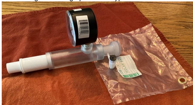
Fig. 1. Photograph of Prototype Device