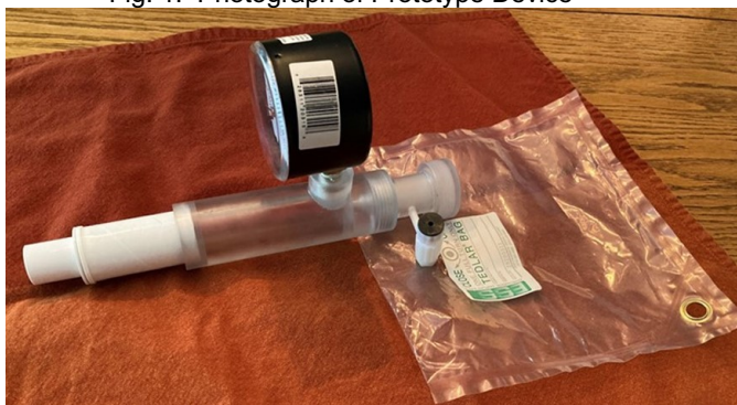
Fig. 1. Photograph of Prototype Device